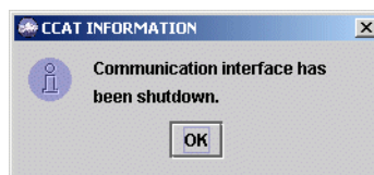
Figure 3–5 Exit CCAT Information Window

A CCAT Information message window appears, telling you that the communication interface has been shut down, as shown in Figure 3–5.