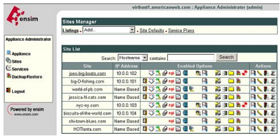
Figure 2. Sample Appliance Administrator GUI

• Appliance Administrator access provides the appliance owner, generally a Reseller, with a simple interface with which to manage popular software programs associated with Web hosting such as Apache Web Server, DNS, Mail, and FTP. The interface allows the owner to add Internet Protocol (IP)-based and name-based sites, as well as rapidly create and deploy hosting plans via a template creator, where DNS, Mail, FTP, Microsoft FrontPage, backup/restore, Web logs, file manager, and many other applications can be enabled and disabled. The interface comes with a customizable navigation bar so that custom Common Gateway Interface (CGI) scripts can be introduced into the hosting environment.