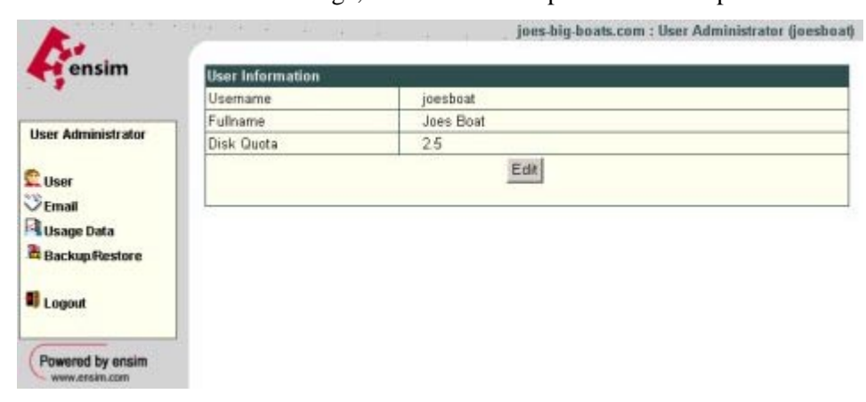
Figure 4. Sample User Administrator GUI

• User Administrator access gives site users the ability to manage their own accounts. With this interface, users can access management utilities such as user and mail managers, obtain information about site usage, and obtain backup-and-restore capabilities.