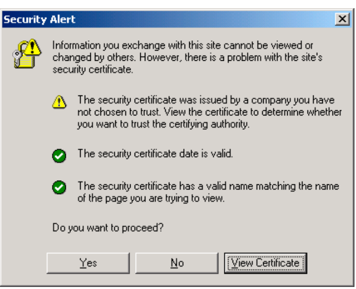
Figure 3 Security Alert

The HP web software comes with a Secure Socket Layer (SSL) server certificate. If you have not previously installed this certificate, you may encounter the security alert shown in Figure 3.