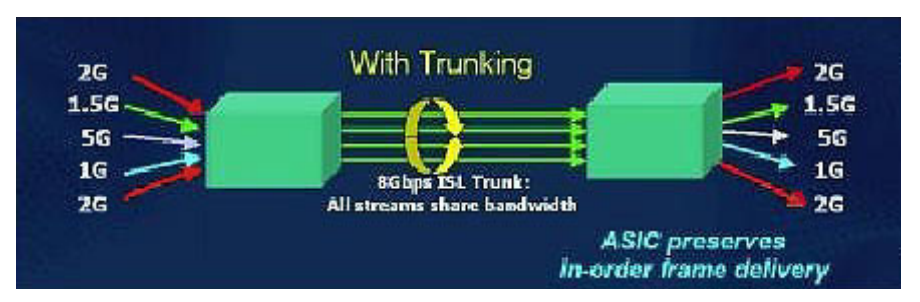
Figure 2: Routing with the ISL Trunking feature