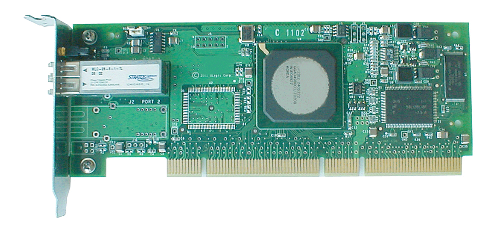
Figure 1-1: FCA2214 HBA