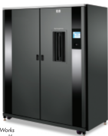
hp StorageWorks ESL9595 tape library