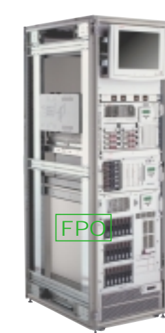
The Compaq 9000 Series maximizes data center density and improves manageability.

Contains two 19" to 31" depth adjustable rails that mount Compaq rack-mountable servers, storage boxes, UPSs and Compaq networking products in third-party racks. The Depth Adjustable Fixed Rail Kit also accommodates most third-party rack-mountable products. Maximum weight capacity: 300 lbs.