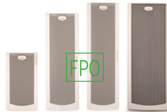
The Compaq 9000 Series rack is available in 22U, 36U and both standard and wide-profile 42U configurations, and can be customized to fit your unique specifications.

The choice is simple. The choice is smart. The Compaq Intelligent Rack. The right rack for the job. For more information on Compaq 9000 Series racks and options, visit our Web site at www.compaq.com/racks .