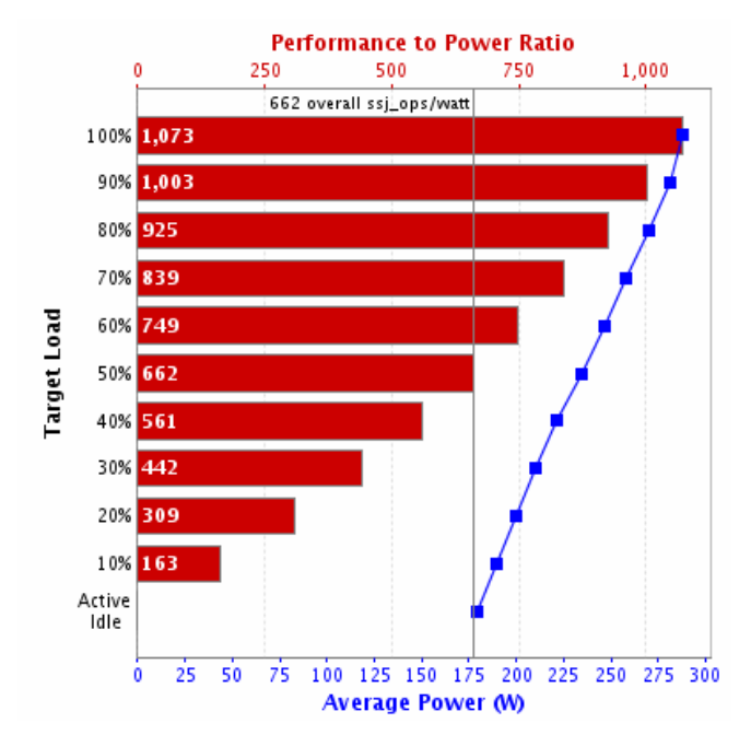
Figure 2. The SPECpower_ssj<sup>™</sup>2008 primary metric is the "overall ssj_ops/watt". The HP ProLiant DL360 G5 showed a 662 overall ssj_ops/watt ratio. This metric is computed by taking the sum of the ssj_ops scores for all target loads, and then dividing by the sum of the power consumption averages for all target loads – including the "active idle" (0% utilization) measurement interval.