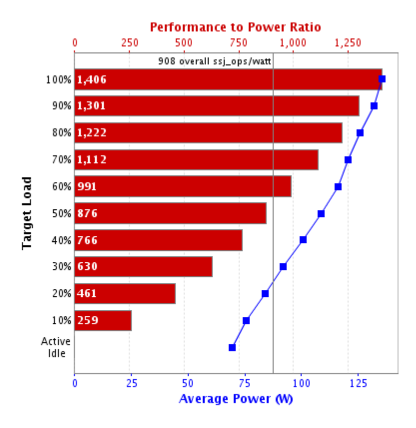
Figure 2. The SPECpower_ssj™2008 primary metric is the "overall ssj_ops/watt". The HP ProLiant DL120 G5 showed a 908 overall ssj_ops/watt ratio. This metric is computed by taking the sum of the ssj_ops scores for all target loads, and then dividing by the sum of the power consumption averages for all target loads – including the "active idle" (0% utilization) measurement interval.